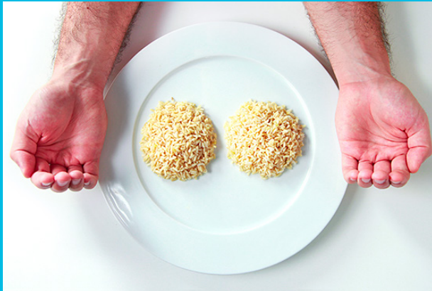
2 cupped handfuls of carb dense foods with most meals