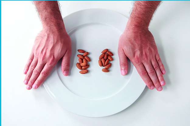
2 entire thumbs of fat dense foods with most meals

Note: Your hand size is related to your body size, making it an excellent portable and personalized way to measure and track food intake.