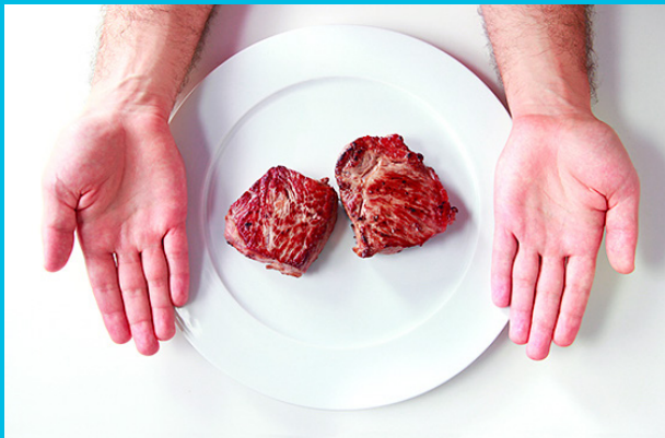
2 palms of protein dense foods with each meal